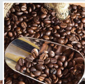
Food Processing Plants

For more information, visit our website at guardair.com/materialmover